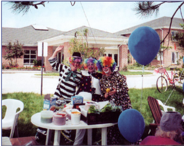
Main Entrance - "Hello and Welcome"

Royal Terrace invites you to visit and experience the pleasant and relaxed surroundings where a variety of amenities, services, and activities have been designed to meet the ever changing needs of the elderly.